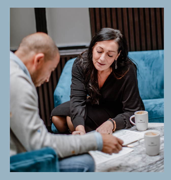
The Wallenstam Group strives to be a modern and dynamic workplace.

The Wallenstam Group shall comply with applicable laws, agreements and industry standards in respect of working hours and remuneration.