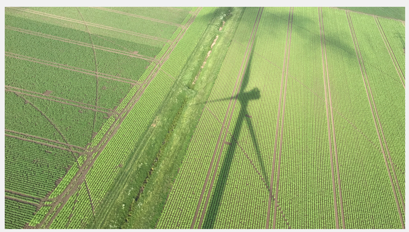
Furulund wind farm - Kristianstad

The value creation mainly occurs by means of cost-efficient new construction, efficient property management and letting as well as successful business transactions. Wallenstam constructs and owns residential properties in attractive areas and in growth markets, primarily in the Stockholm and Gothenburg regions. Our commercial properties are found in inner city locations in Gothenburg. Our business concept is to develop, build, buy and sell properties in selected metropolitan areas that are sustainable for people and companies in the long term. We want to contribute to a good standard of living for many people by producing housing and developing safe and lively city districts. We believe it is important to have a variety of forms of housing in society and we safeguard the rental apartment as a form of accommodation.