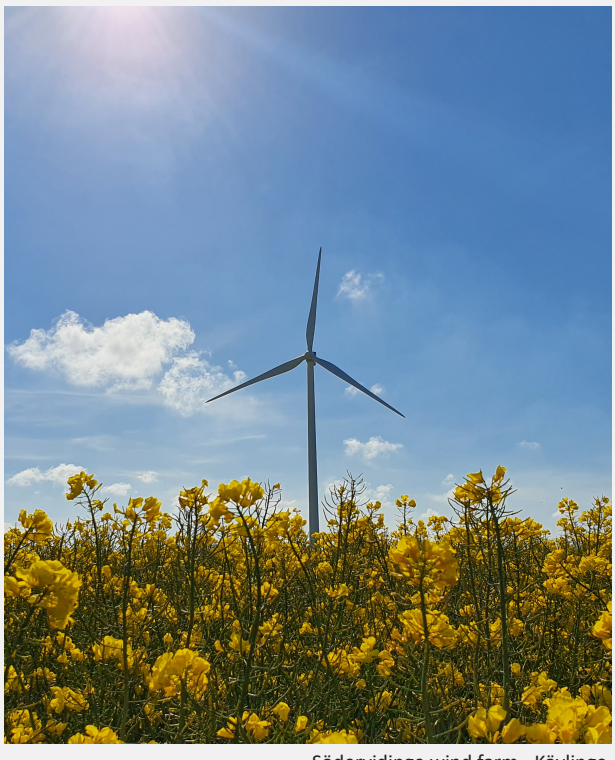
Södervidinge wind farm - Kävlinge

Agenda 2030 and the Sustainable Development Goals ("SDG") were adopted by the United Nations General Assembly on September 25, 2015. There are 17 global goals with 169 defined underlying targets, aimed at achieving long-term sustainable economic, social and environmental development in order to eradicate extreme poverty, to reduce inequality and injustice in the world, and to fight climate change.