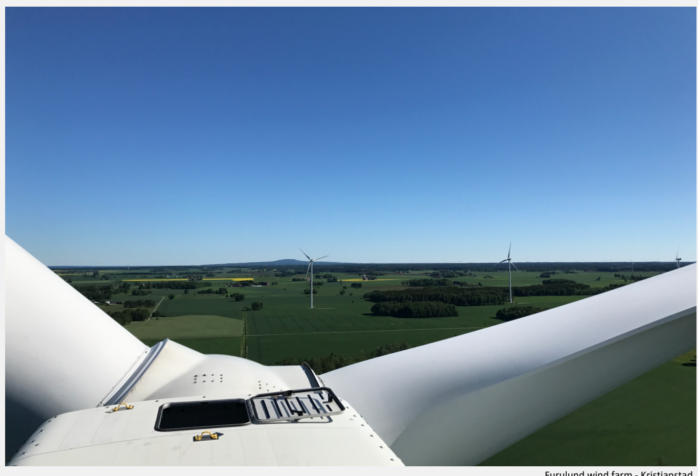
Furulund wind farm - Kristianstad