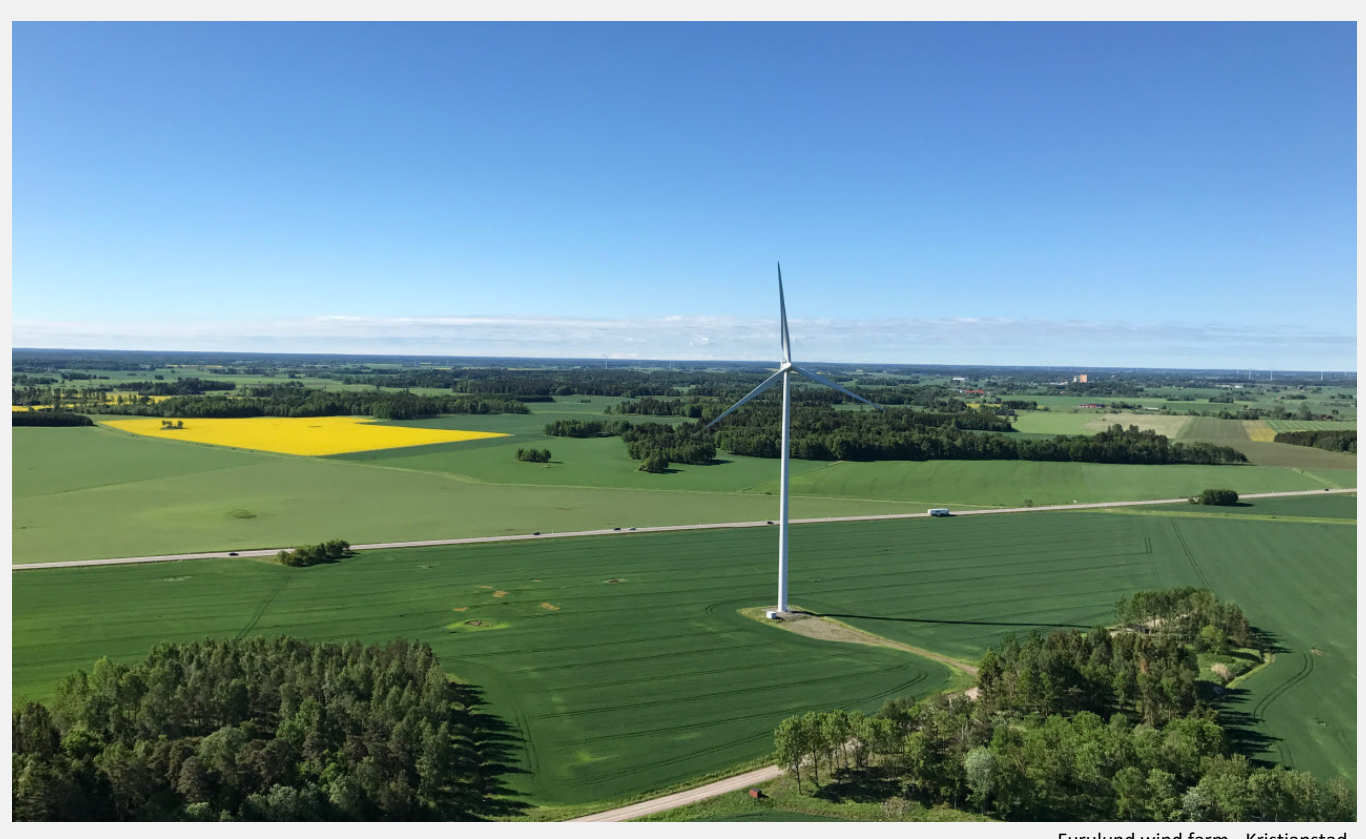
Furulund wind farm - Kristianstad