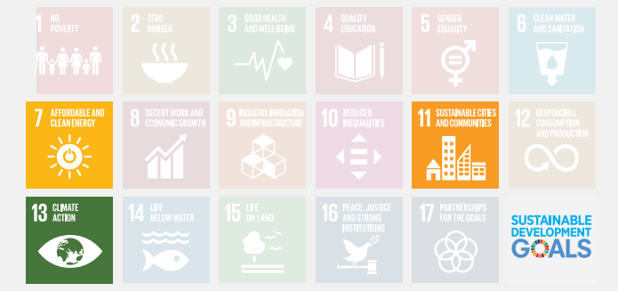
THE FRAMEWORK MAINLY TARGETS THE ABOVE SUSTAINABLE DEVELOPMENT GOALS