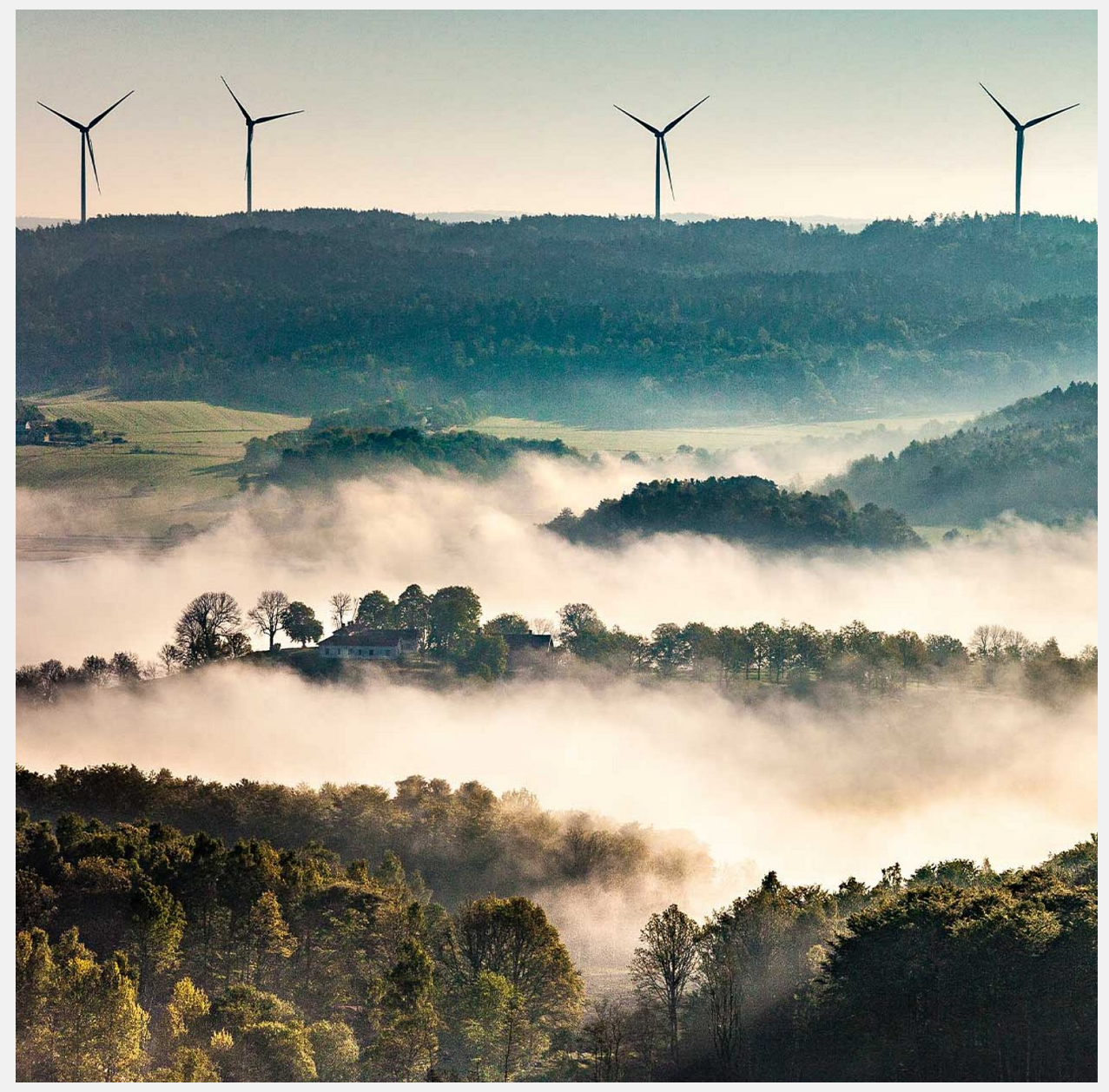
Gunnarby wind farm - Uddevalla