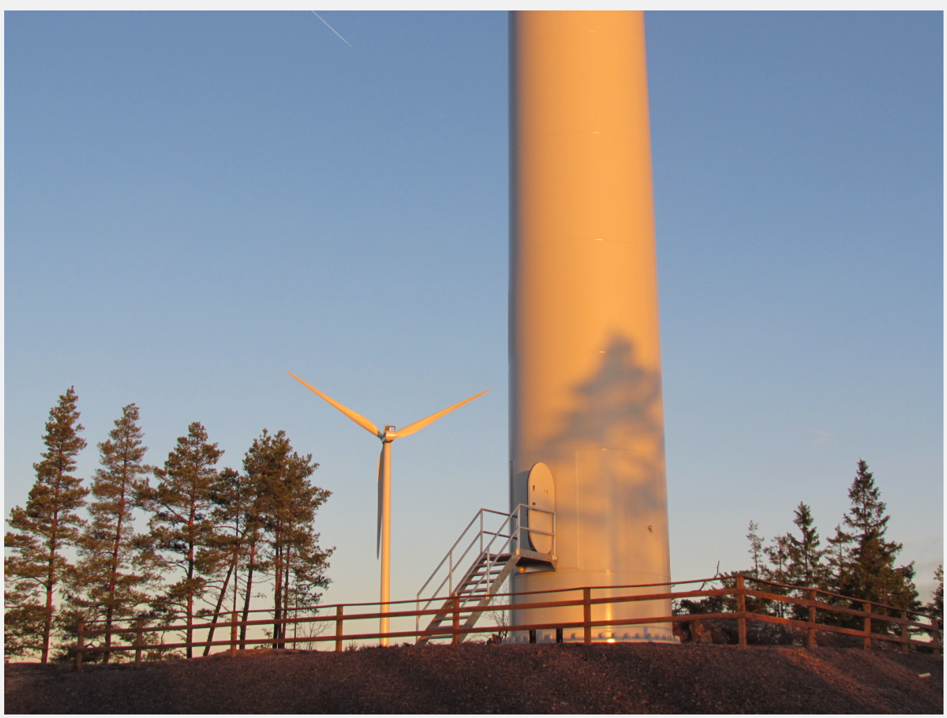
Järmunderöd wind farm - Munkedal

We believe that integrated sustainability work and strong social engagement go hand in hand with long-term profitability. This delivers good control, minimizes business and operational risks, increases efficiency, generates new solutions and business transactions and also ensures more committed employees, more secure investors and more satisfied customers. For this reason, sustainability is a core part of our business model.