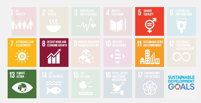
WALLENSTAM FOCUSES ON THE ABOVE SUSTAINABLE DEVELOPMENT GOALS