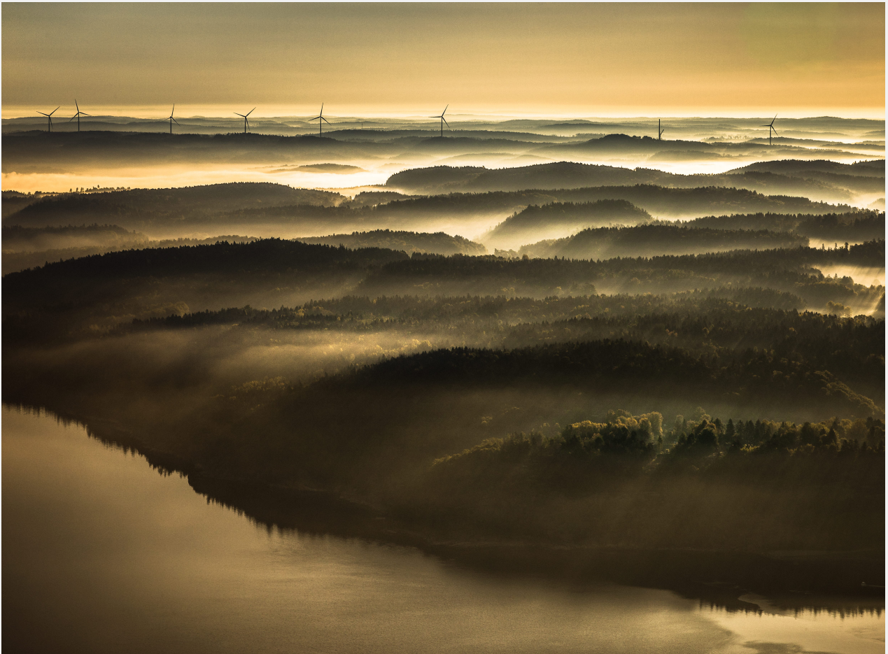
Gunnarby wind farm - Uddevalla