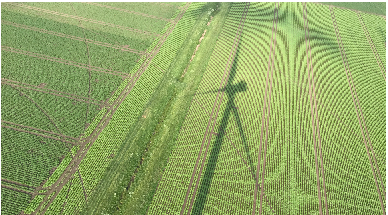
Furulund wind farm - Kristianstad

Wallenstam constructs and owns residential properties in attractive areas and in growth markets, primarily in the Stockholm and Gothenburg regions. Our commercial properties are found in inner city locations in Gothenburg. Our business concept is to develop, build, buy and sell properties in selected metropolitan areas that are sustainable for people and companies in the long term. We want to contribute to a good standard of living for many people by producing housing and developing safe and lively city districts. We believe it is important to have a variety of forms of housing in society and we safeguard the rental apartment as a form of accommodation.