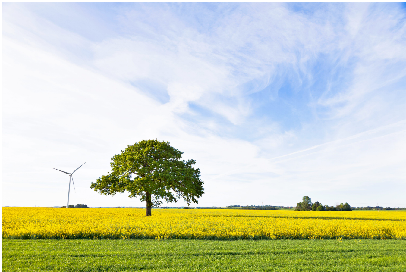
Södervidinge wind farm - Kävlinge

We believe that integrated sustainability work and strong social engagement go hand in hand with long-term profitability. This delivers good control, minimizes business and operational risks, increases efficiency, generates new solutions and business transactions and also ensures more committed employees, more secure investors and more satisfied customers. For this reason, sustainability is a core part of our business model.