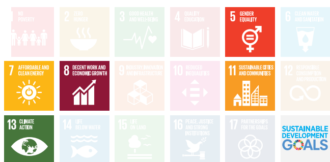
WALLENSTAM FOCUSES ON THE ABOVE SUSTAINABLE DEVELOPMENT GOALS