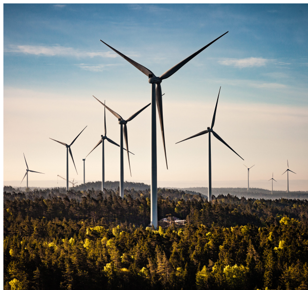
Gunnarby wind farm - Uddevalla

Agenda 2030 and the Sustainable Development Goals ("SDG") were adopted by the United Nations General Assembly on September 25, 2015. There are 17 global goals with 169 defined underlying targets, aimed at achieving long-term sustainable economic, social and environmental development in order to eradicate extreme poverty, to reduce inequality and injustice in the world, and to fight climate change.