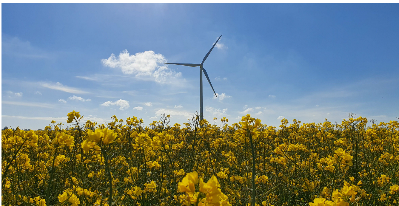
Furulund wind farm - Kristianstad