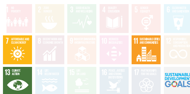
THE FRAMEWORK MAINLY TARGETS THE ABOVE SUSTAINABLE DEVELOPMENT GOALS