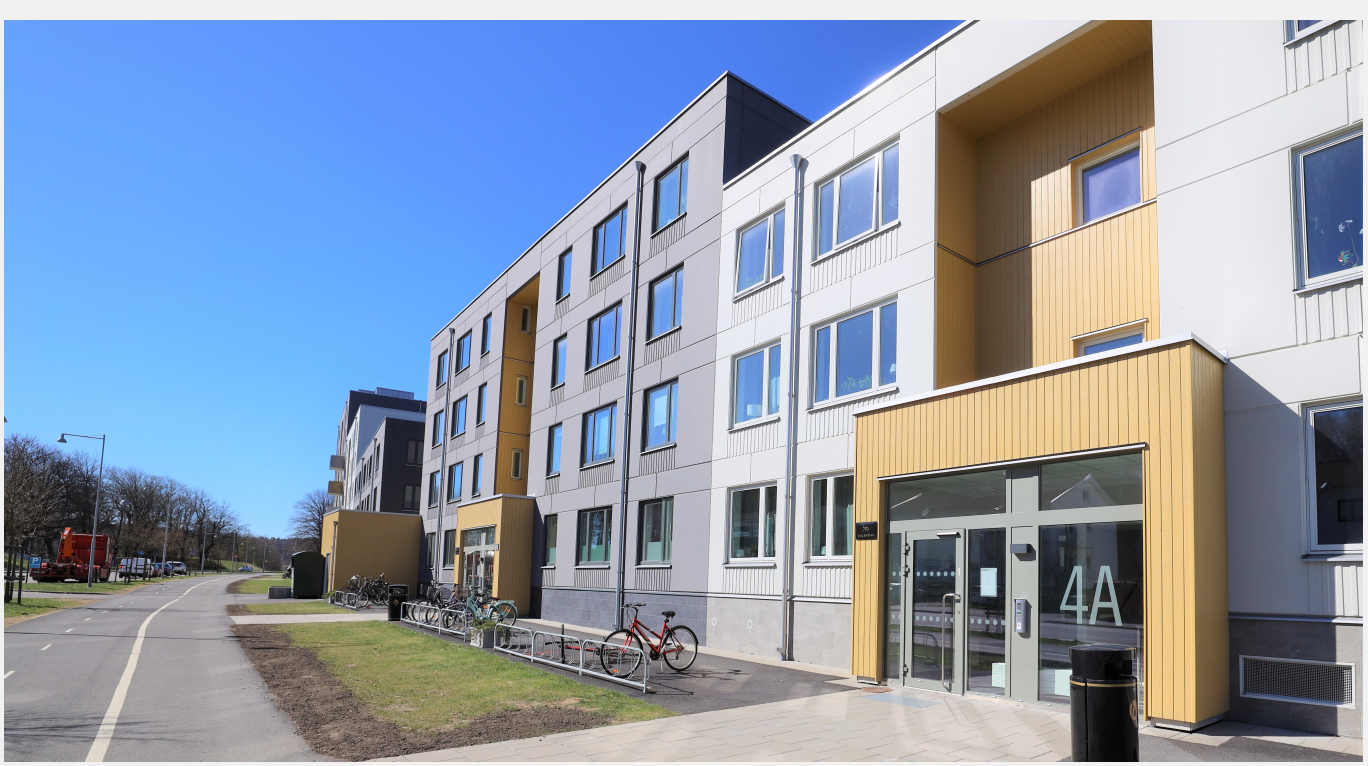
Stallbacken 26 - Gothenburg

The value creation mainly occurs by means of cost-efficient new construction, efficient property management and letting as well as successful business transactions. Wallenstam constructs and owns residential properties in attractive areas and in growth markets, primarily in the Stockholm and Gothenburg regions. Our commercial properties are found in inner city locations in Gothenburg. Our business concept is to develop, build, buy and sell properties in selected metropolitan areas that are sustainable for people and companies in the long term. We want to contribute to a good standard of living for many people by producing housing and developing safe and lively city districts. We believe it is important to have a variety of forms of housing in society and we safeguard the rental apartment as a form of accommodation.