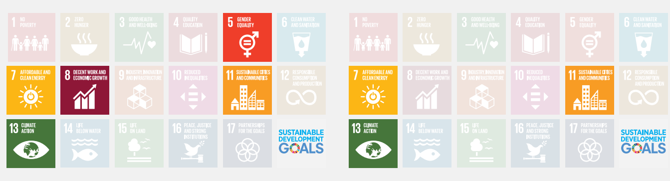
WALLENSTAM FOCUSES ON THE ABOVE SUSTAINABLE DEVELOPMENT GOALS