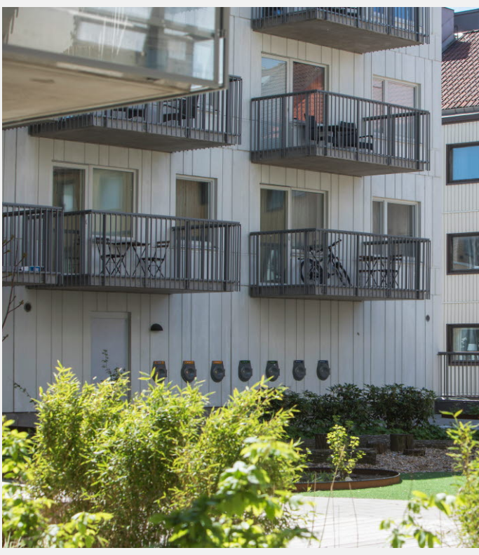
Brämaregården 62:1 - Gothenburg