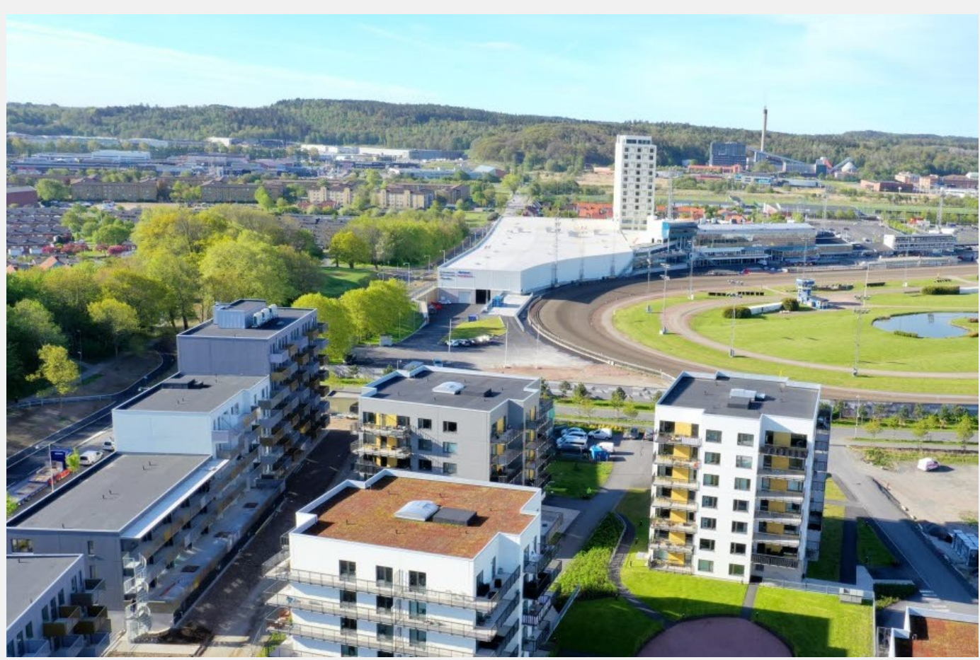
Stallbacken 26 - Gothenburg

We believe that integrated sustainability work and strong social engagement go hand in hand with long-term profitability. This delivers good control, minimizes business and operational risks, increases efficiency, generates new solutions and business transactions and also ensures more committed employees, more secure investors and more satisfied customers. For this reason, sustainability is a core part of our business model.