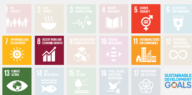
WALLENSTAM FOCUSES ON THE ABOVE SUSTAINABLE DEVELOPMENT GOALS