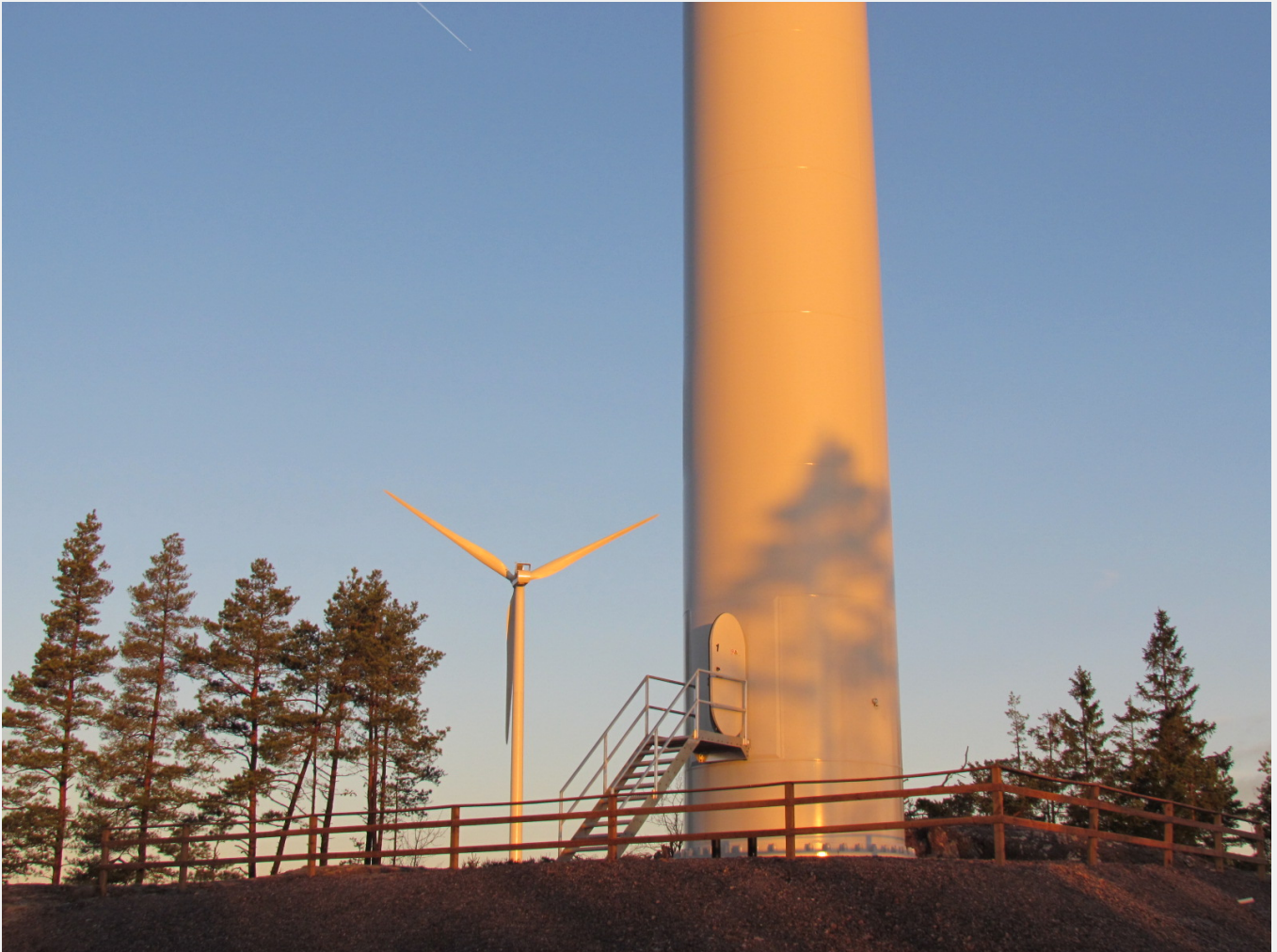
Järnunderöd wind farm - Munkedal

We believe that integrated sustainability work and strong social engagement go hand in hand with long-term profitability. This delivers good control, minimizes business and operational risks, increases efficiency, generates new solutions and business transactions and also ensures more committed employees, more secure investors and more satisfied customers. For this reason, sustainability is a core part of our business model.