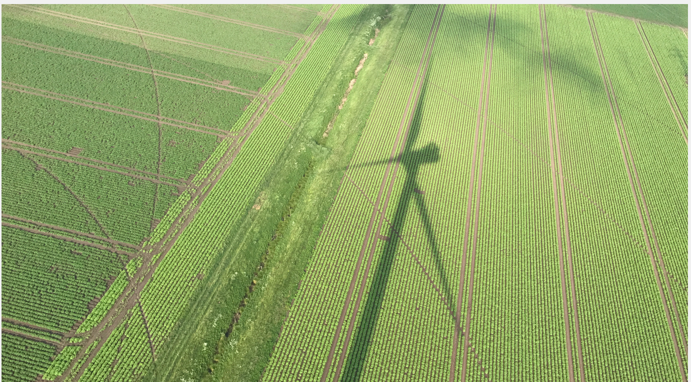
Furulund wind farm - Kristianstad

Wallenstam constructs and owns residential properties in attractive areas and in growth markets, primarily in the Stockholm and Gothenburg regions. Our commercial properties are found in inner city locations in Gothenburg. Our business concept is to develop, build, buy and sell properties in selected metropolitan areas that are sustainable for people and companies in the long term. We want to contribute to a good standard of living for many people by producing housing and developing safe and lively city districts. We believe it is important to have a variety of forms of housing in society and we safeguard the rental apartment as a form of accommodation.