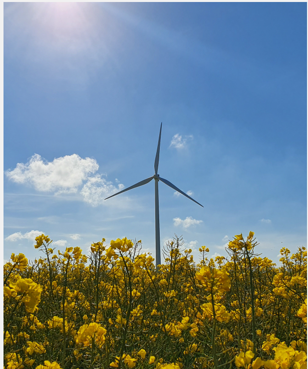
Södervidinge wind farm - Kävlinge

Agenda 2030 and the Sustainable Development Goals ("SDG") were adopted by the United Nations General Assembly on September 25, 2015. There are 17 global goals with 169 defined underlying targets, aimed at achieving long-term sustainable economic, social and environmental development in order to eradicate extreme poverty, to reduce inequality and injustice in the world, and to fight climate change.