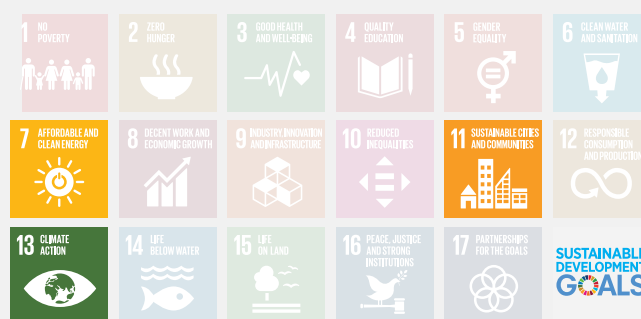
THE FRAMEWORK MAINLY TARGETS THE ABOVE SUSTAINABLE DEVELOPMENT GOALS