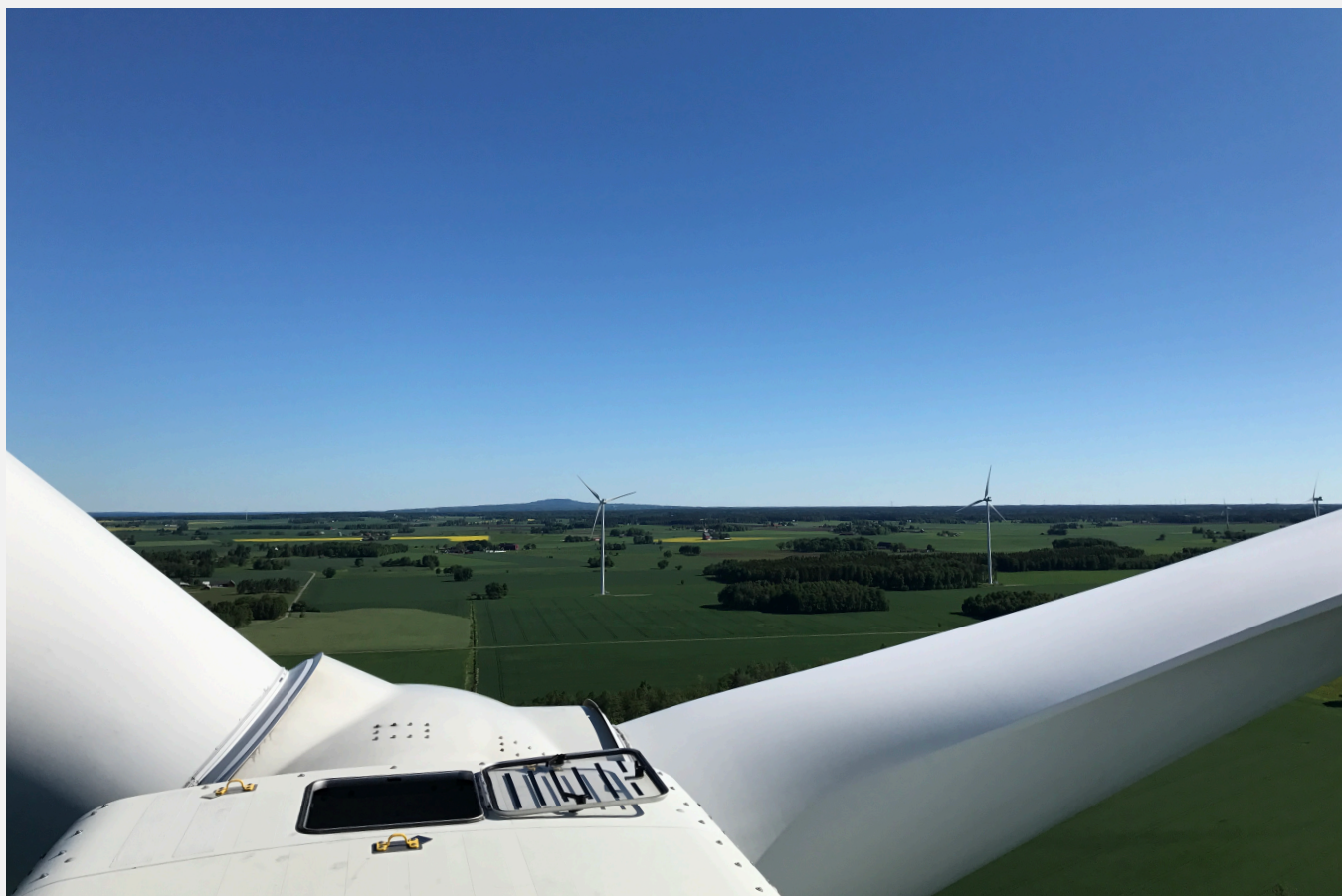
Furulund wind farm - Kristianstad