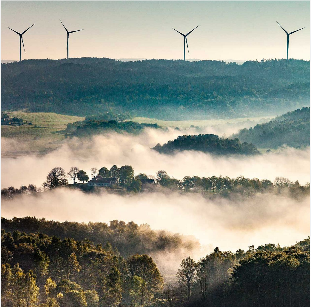
Gunnarby wind farm - Uddevalla