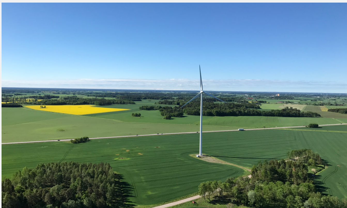
Furulund wind farm - Kristianstad